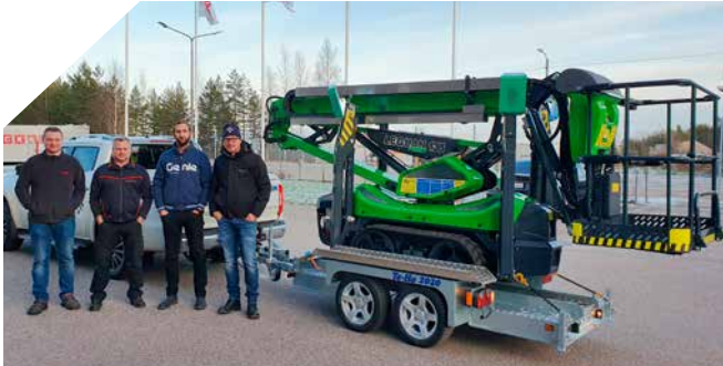
Top left: The Liftexperten team from Norway was introduced to their first demo machine by Leguan's technical engineer.