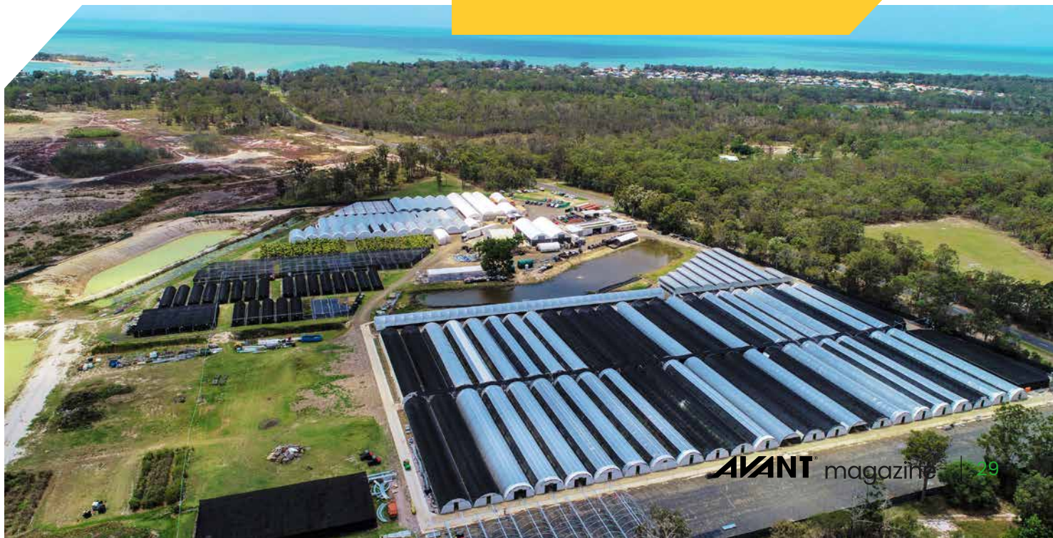
Hervey Bay nurseries

This interview was done in January. After that, Hervey Bay has bought a new 860i loader. ●