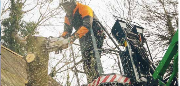
Top right: Roots to Shoots knows how to cut down trees safely.