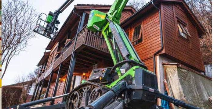
Below right: Norwegian Voss Liftutleige's Leguan 190 in action.