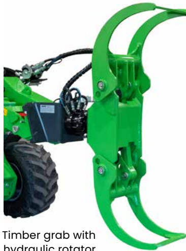
Timber grab with hydraulic rotator