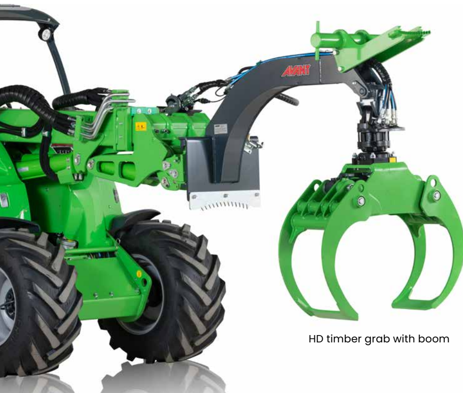
HD timber grab with boom