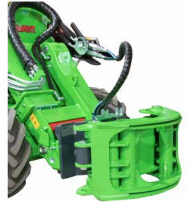
Timber grab without rotator