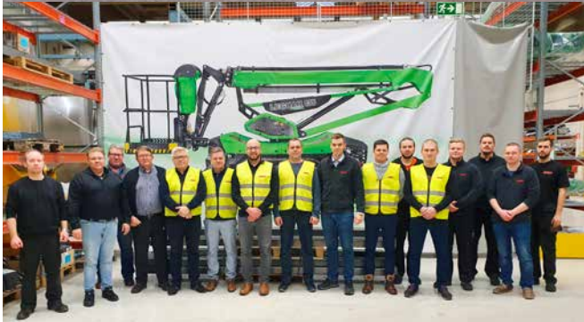
Below left: Staff from Simeri, Simeri Estonia and Leguan Lifts met as the co-operation expanded.