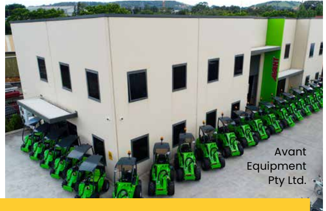
Avant Equipment Pty Ltd.