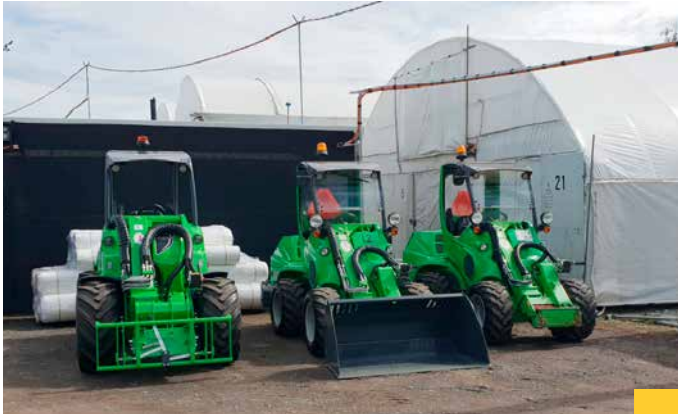
Original 700's loaders and the new 860 at Hervey Bay.